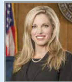
Hon. Beth Aldridge